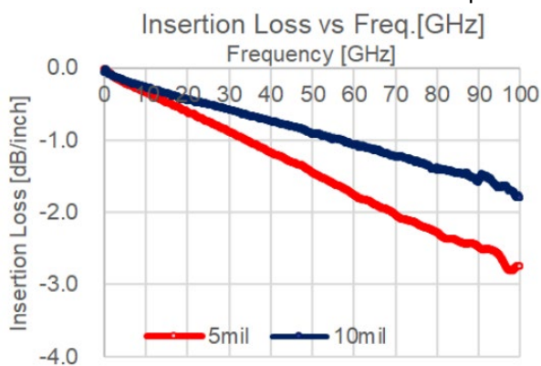
HF-300F Offers Superior RF Performance Over Frequency

HF-300F is well suited for hybrid multilayer applications. Emerging multilayer telecom applications put new demands on RF materials. HF-300F is dimensionally stable, has a low CTE, and is lightweight. HF300F is based on a rigid thermoset resin system and offers advantages in PCB fabrication for large format, multilayer applications. HF-300F has all of the characteristics of materials normally used for high speed digital with the added features that thicker dielectrics can be manufactured with tightly controlled RF properties. Traditional thermoset laminates can degrade by oxidation with time and elevated temperatures. Oxidation is permanent and leads to a shift toward a higher dielectric constant, elevated loss values, and changing color. The impact of shifting dielectric properties depends on circuit design, operating power, and use temperature. HF-300F has been developed with much better resistance to oxidation. HF300F also has low moisture absorption. The combination of low moisture absorption and stable dielectric properties over time, temperature, and frequency, make HF-300F very attractive for RF antenna applications in demanding environments. HF-300F can be fabricated using standard FR-4 PCB fabrication without special hole wall preparation. The low CTE values enable reliable hybrid multilayer constructions. HF-300F is a highly engineered composite designed to meet the demands of high volume RF / microwave applications.