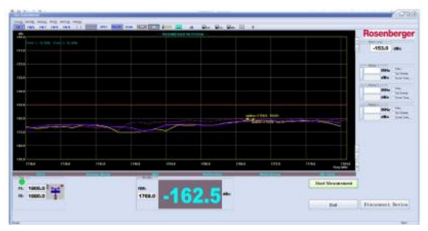
PIMD example of TLY-5Z-0300-CL1/CL1

TLY-5Z's improved PTH reliability results in consistent PIMD levels in PWB designs with plated through holes even after repeated thermal cycling.